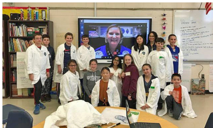
Figure 4. A class of students and their flight director who have just successfully completed (and rescued the endangered population) an Operation Montserrat e-Mission .

OM and subsequent simulations are complete curriculum packages. Prior to conducting a sim, teachers receive instruction about the science and math issues, the simulation software, and technical requirements. Additional modules describe problem-based learning, which is the theory that guides sim development. During the one to two weeks before the day of the sim the teacher uses provided cross-curriculum lesson plans to review relevant science. Students are assigned roles, and learn the computer interface they will interact with during the mission, preparing them with skills and experience needed to perform their jobs on mission day. The curriculum is based on national standards regarding science, math, problem-solving, and critical thinking skills, as well as life skills promoting teamwork and communication.