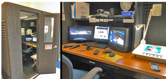
Figure 2. An e-Mission is led by a flight director sitting within a soundproof booth (left) containing digital equipment for video-conferencing, and displaying to students, videos and images of mission location, maps and data (right).

Our Sustainability Solution – e-Missions . Challenger on-site missions are sustainable but at costs that can be met only