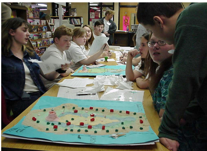
Figure 3. During the Operation Montserrat e-Mission , middle school students use maps and other data to determine where to evacuate the island's population based on calculations of when and where the volcano may erupt and the hurricane may make landfall.

that the Soufriere Hills volcano on the Caribbean island of Montserrat is starting to erupt just as a hurricane approaches. A web-delivered program created by the Wheeling team, provides videos, images, maps and a continuing stream of changing eruption and hurricane data that students plot and analyze to predict upcoming events and make decisions for transporting islanders to safety. Middle school students on four teams - volcano, hurricane, evacuation and communication - apply their science knowledge and math skills to determine if, when and where the volcano will erupt, and if, when and where the hurricane will make landfall. As these calamities evolve, the evacuation team determines the best routes and transportation needs to evacuate residents to safe areas, while the communication team coordinates science information and predictions with the rescue operation. There is uncertainty if the teams will save the residents, and palpable feelings of success if/when they do. Students are so immersed in the simulated mission that they often ask at the end if everyone is safe (Figure 4).