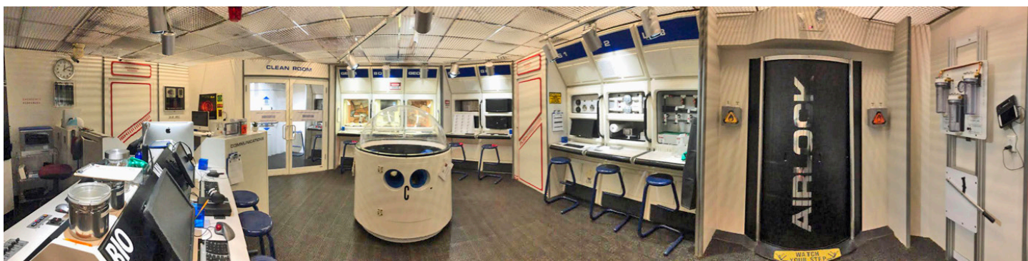
Figure 1. A panoramic view of a traditional Challenger facility that models an orbiting spacecraft laboratory. A companion space mimics Houston's mission control. During each CLC onsite mission, students gain experiences from both mission control and the space lab.