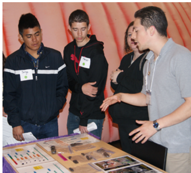
Figure 2. On the left, student visitors show high levels of excitement and interest in a festival exhibit and the presenter. On the right, under-graduate students representing the Washington State Opportunity Scholarship and UW CAMP serve as exhibit presenters and ham it up with brains and nervous tissue.

"My students got exposure to many things they do not get opportunities to experience. They benefitted from talking to professional scientists." -Festival Teacher